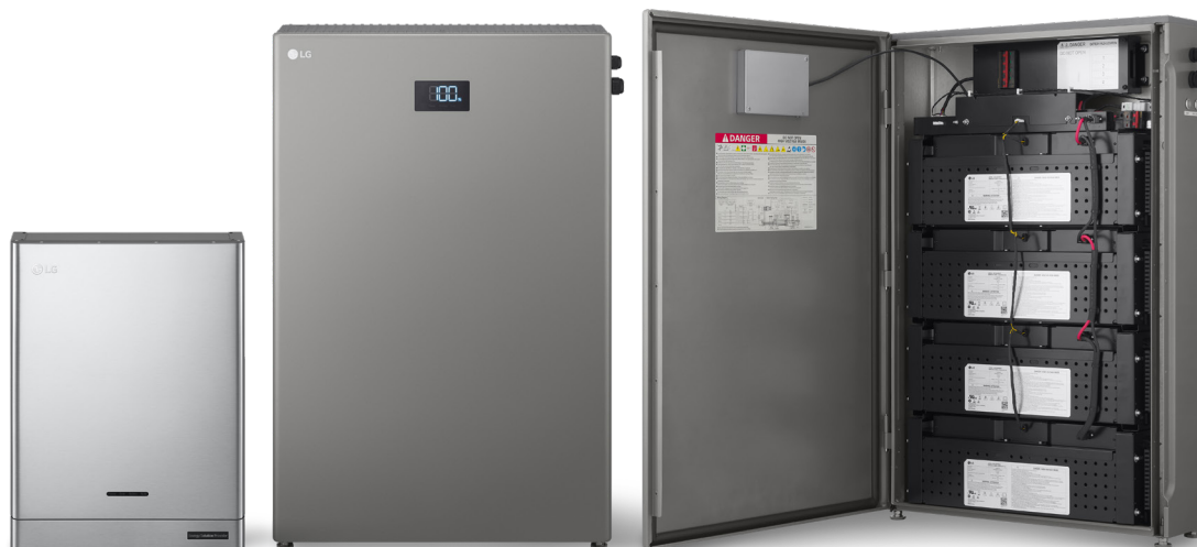
LG ESS Home 8 | 10 D008KE1N211 D010KE1N211

The LG Electronics ESS is a state-of-the-art home energy system designed for homeowners ready to take control of their home energy usage. It offers reliable power both day and night from a highly efficient system. Expertly designed, the battery usable capacity can be expanded up to 28.5kWh without any additional devices.